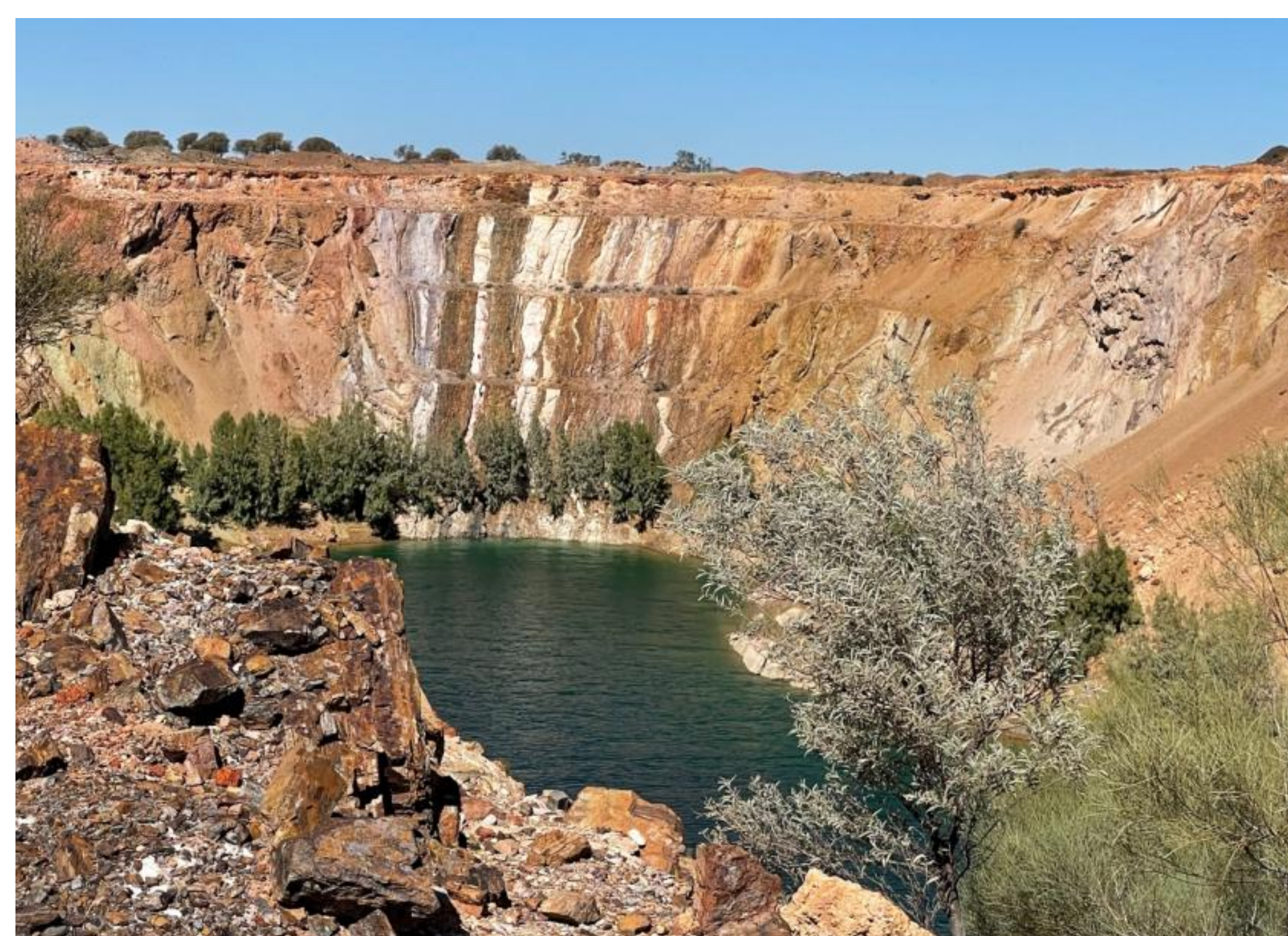
Brightstar Resources is about to kick off a busy drilling season at its Cork Tree Well project in Western Australia's Laverton gold belt.

Gold developer Brightstar Resources has a rig in the wings for a 10,000m reverse circulation drilling program at its Cork Tree Well project in WA's highly prospective Laverton gold belt. The company says the planned work is designed to significantly grow its resource in addition to hitting a new target that has historically recorded a 2m hit going 27.87 g/t gold.