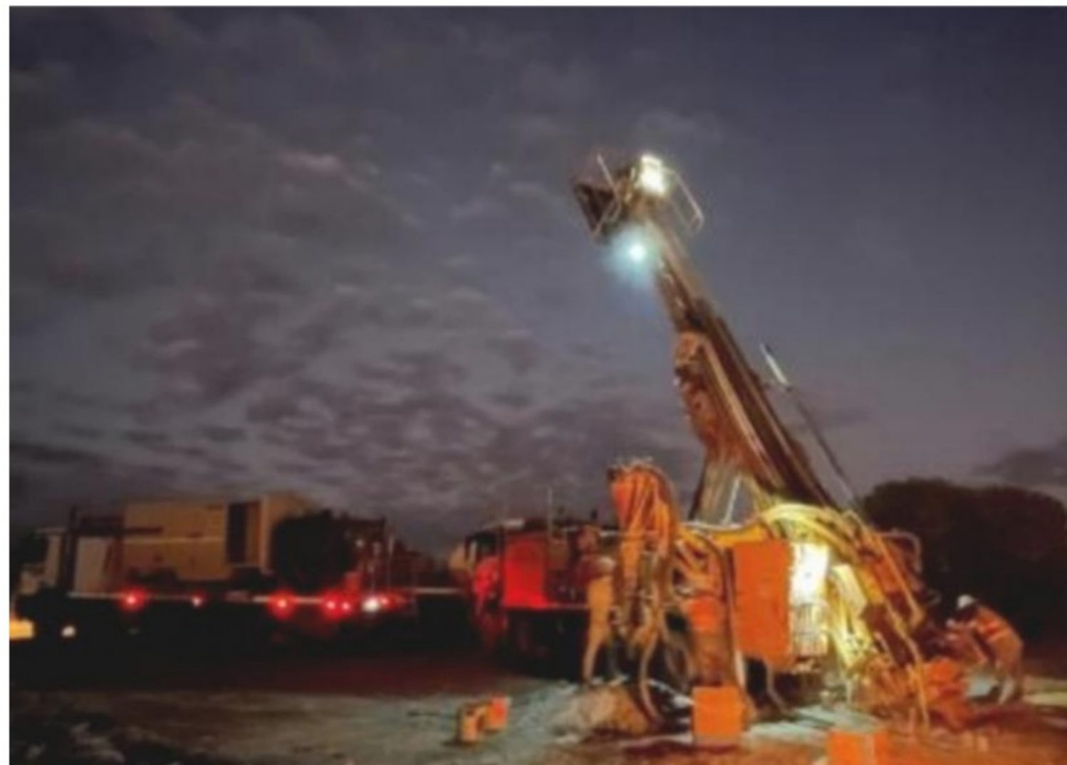
Drilling at dusk at Brightstar's Cork Tree Well project near Laverton.

Brightstar Resources' confidence in the potential of its flagship Cork Tree Well project near Laverton continues to grow with gold assays from an extensional RC drill hole providing the latest boost. Results include 6m at 3.17 grams per tonne gold from 182 metres and the additional strike length opened up by the drill hole has persuaded the company to redouble its efforts next year.