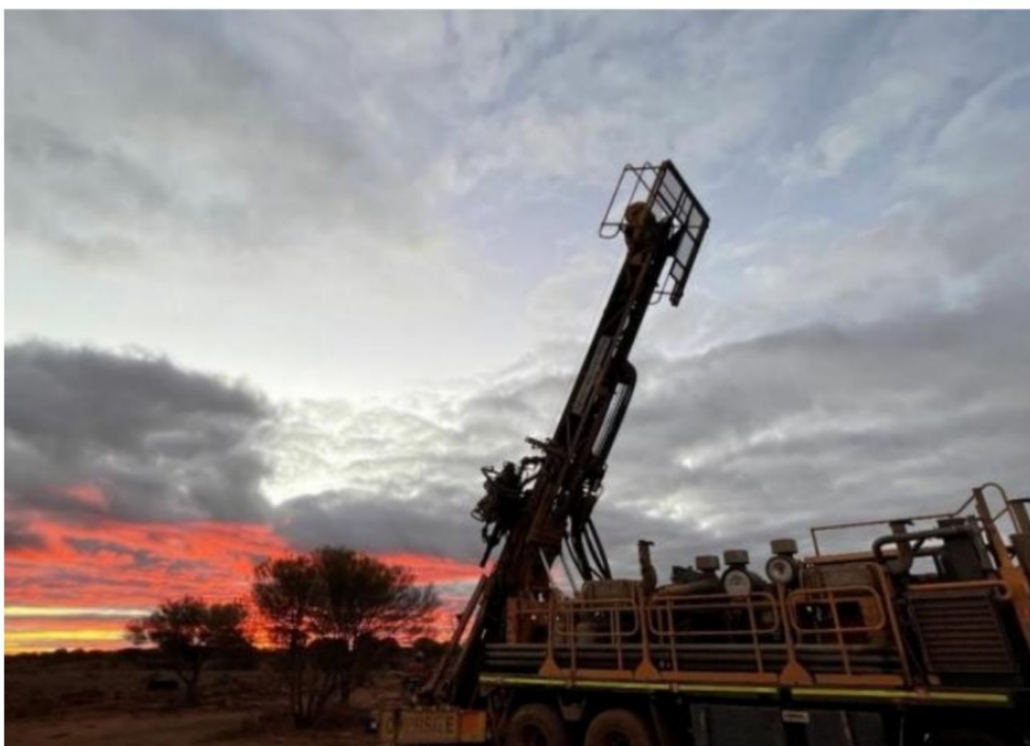
Drilling at Brightstar Resources' Cork Tree Well project.

WA Gold developer Brightstar Resources has completed its latest drilling programs as it presses on with the company's ambitions of boosting the resource at its Laverton Goldfields' project and getting its processing plant out of mothballs. RC drilling programs were conducted at Brightstar's Cork Tree Well and Alpha projects and an air-core program at its Queen of Hearts South prospect, south of the plant.