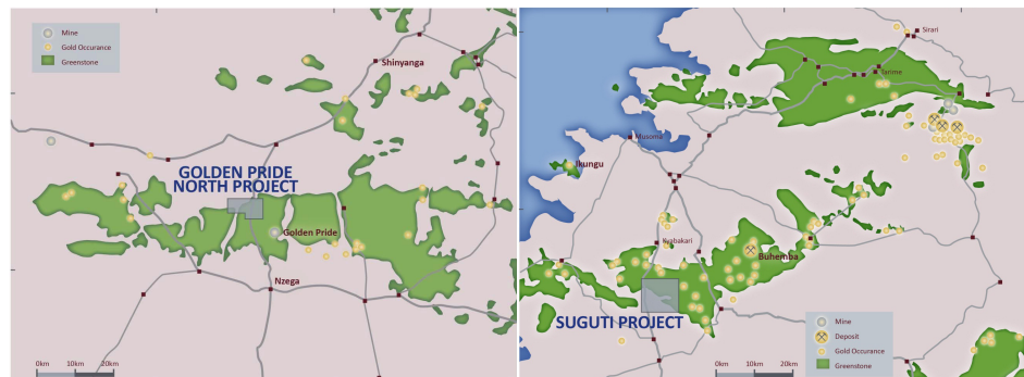
Figure 1: Golden Pride North and Suguti, project locations